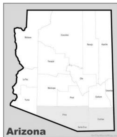
Figure 1.1: Southern Arizona

How do we loosely define Southern Arizona? In this book, we define Southern Arizona as Pima, Cochise, and Santa Cruz Counties, but include many incidents in parts of the neighboring counties: Gila, Graham, Greenlee, and Pinal Counties. It does not include Yuma County, although there is an exception, the young couple who landed their little Cessna in the hostile desert of eastern Yuma County in 1951. They walked away from the undamaged aircraft and despite being followed for some distance by dedicated searchers enduring the brutal July heat, they were never heard from again. Also, there are at least a dozen incidents here where the expertise of our local First Responders was urgently requested by authorities in Mexico or it became necessary for the Southern Arizonans to cross the border. See Figure 1.1, which was downloaded from https://ontheworldmap.com/usa/state/arizona/arizona-county-map.html , and then shaded to identify Southern Arizona.